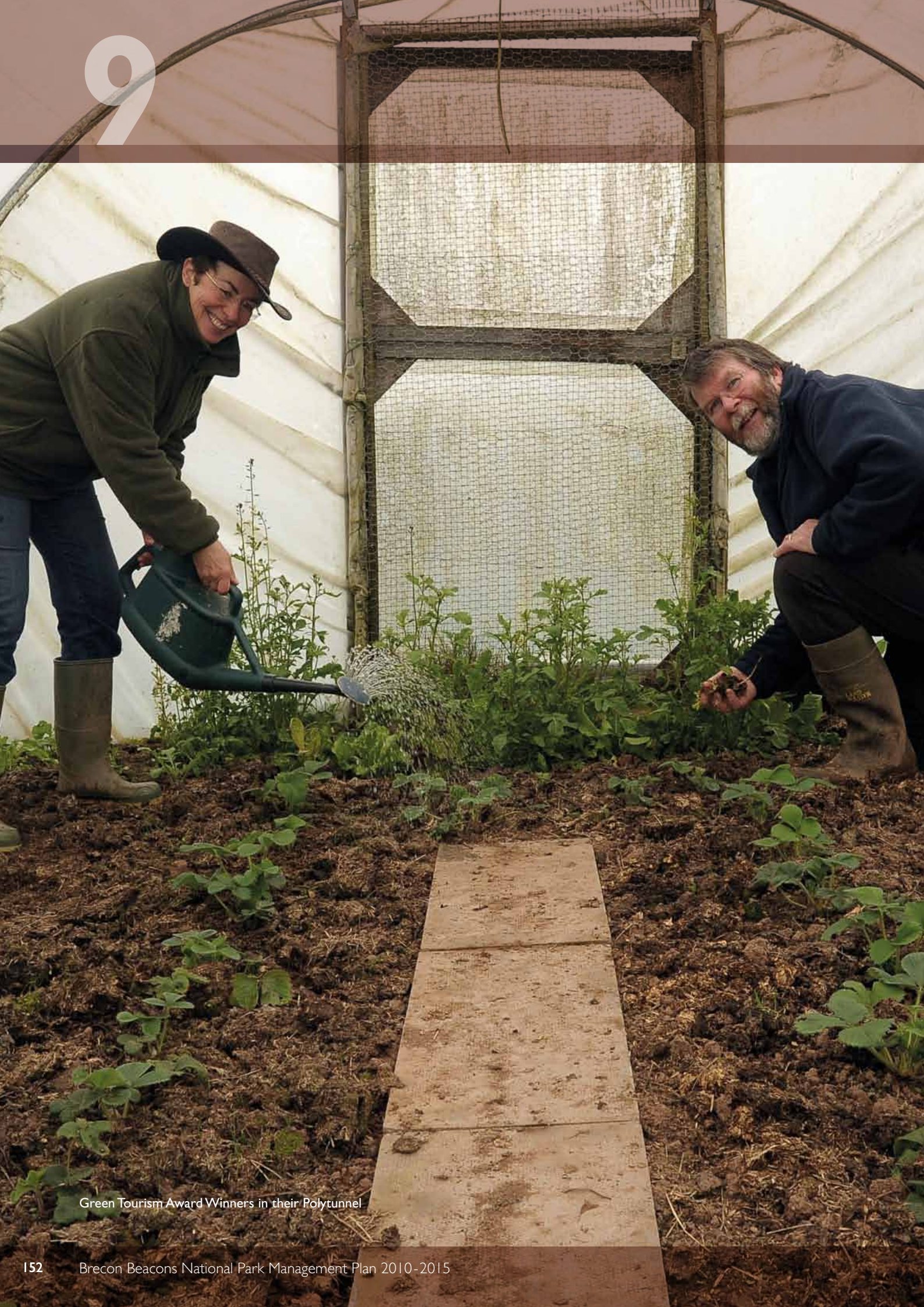
Green Tourism Award Winners in their Polytunnel