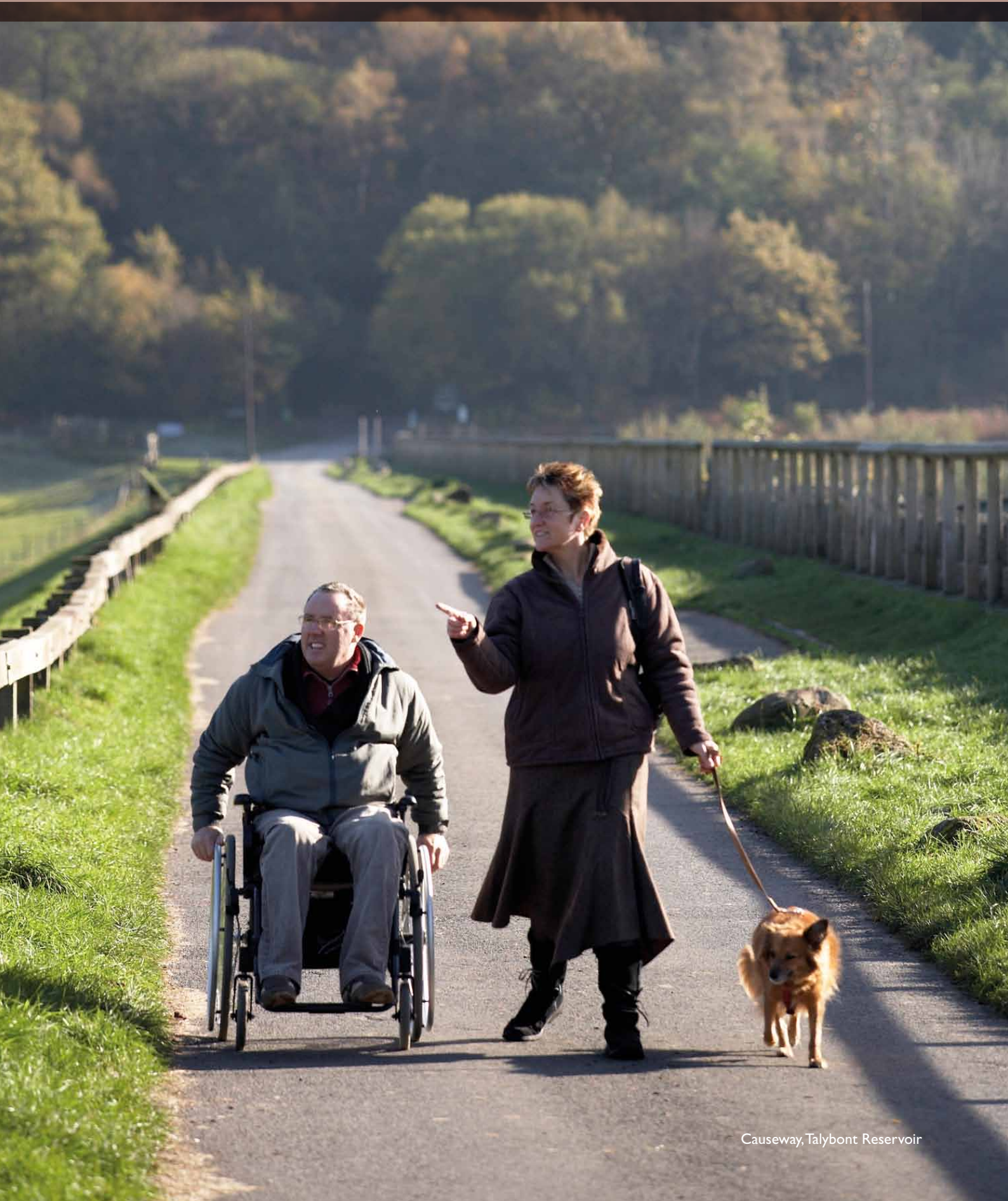
Causeway, Talybont Reservoir